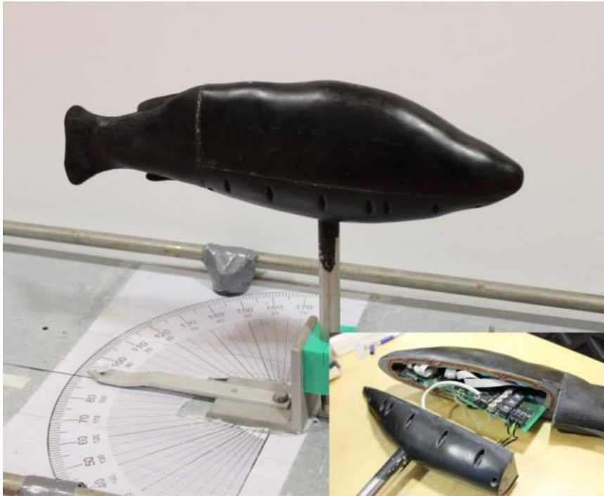
Fig.1. A lateral line probe developed in BONUS FISHVIEW is attached to a force measurement device for calibration.