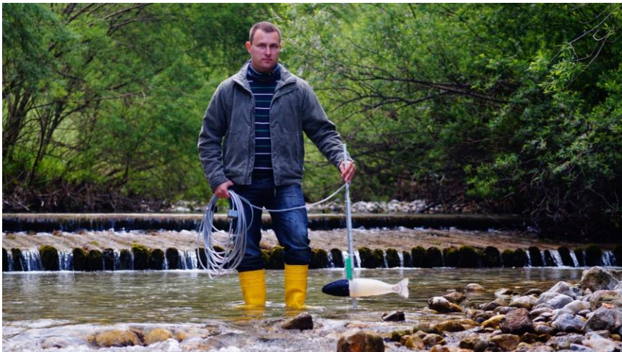
Fig. 2. Testing an artificial lateral line probe in natural flows.