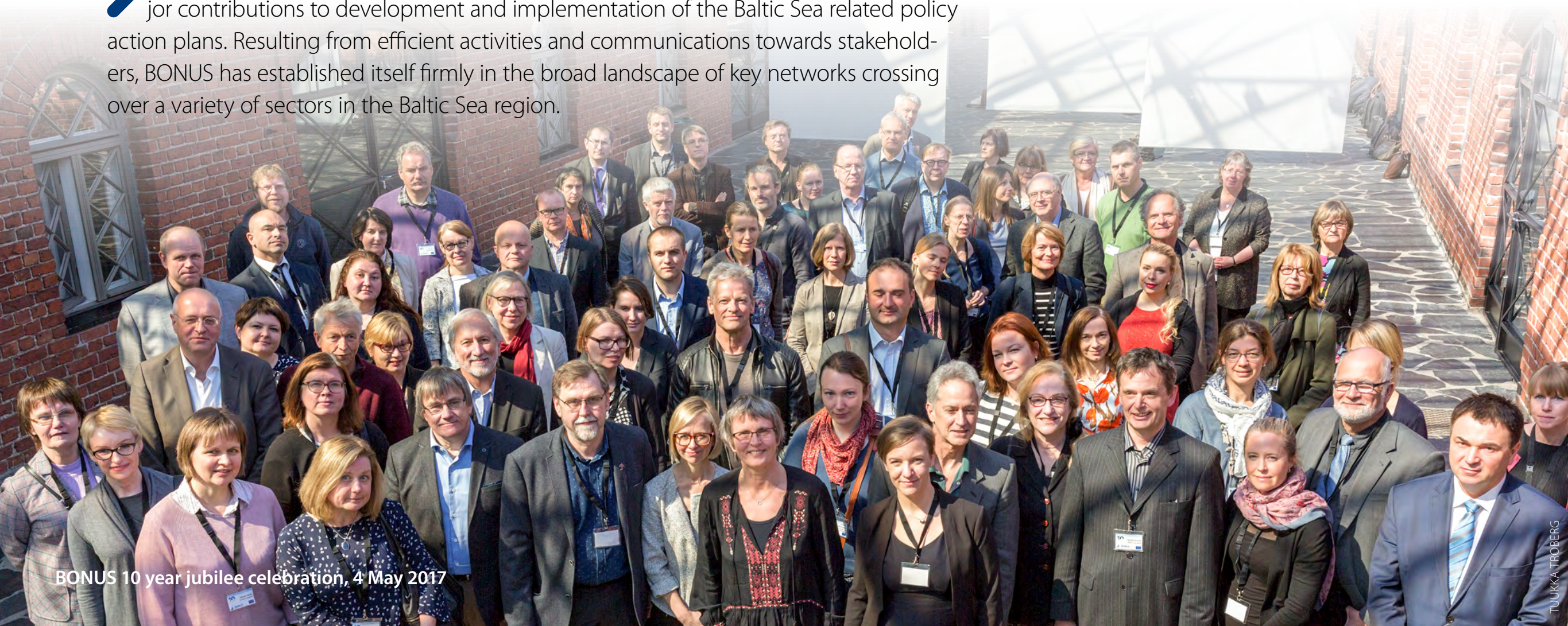
BONUS 10 year jubilee celebration, 4 May 2017

➤ Research results based on a jointly agreed strategic research agenda are making major contributions to development and implementation of the Baltic Sea related policy action plans. Resulting from efficient activities and communications towards stakeholders, BONUS has established itself firmly in the broad landscape of key networks crossing over a variety of sectors in the Baltic Sea region.