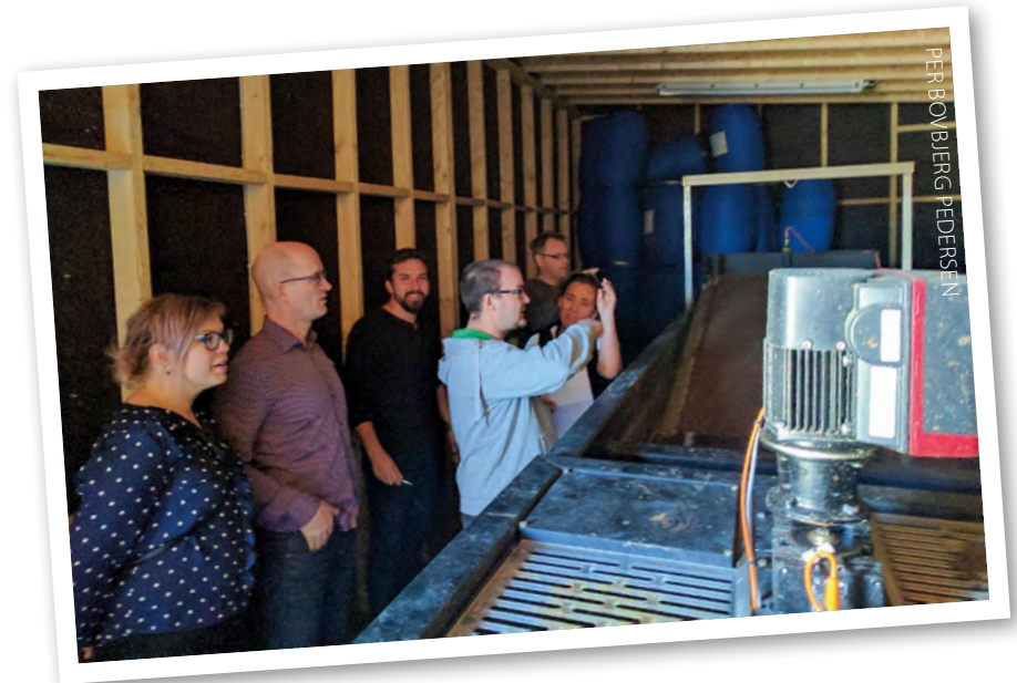
BONUS CLEANAQ participants studying aquaculture sludge treatment at a commercial farm during the project kick-off meeting.

➤ The BONUS clustering activities have resulted in production of larger knowledge synthesis publications: a team led by BONUS BIO-C3 and involving eight BONUS projects submitted a manuscript "The Baltic Sea as time machine for the global coastal ocean" and another team involving authors of six projects produced a manuscript on the issues of standardising climate and socio-political scenarios for the Baltic Sea region. Also a special issue of AMBIO in early 2019 will synthesise the results of the 3rd BONUS Symposium.