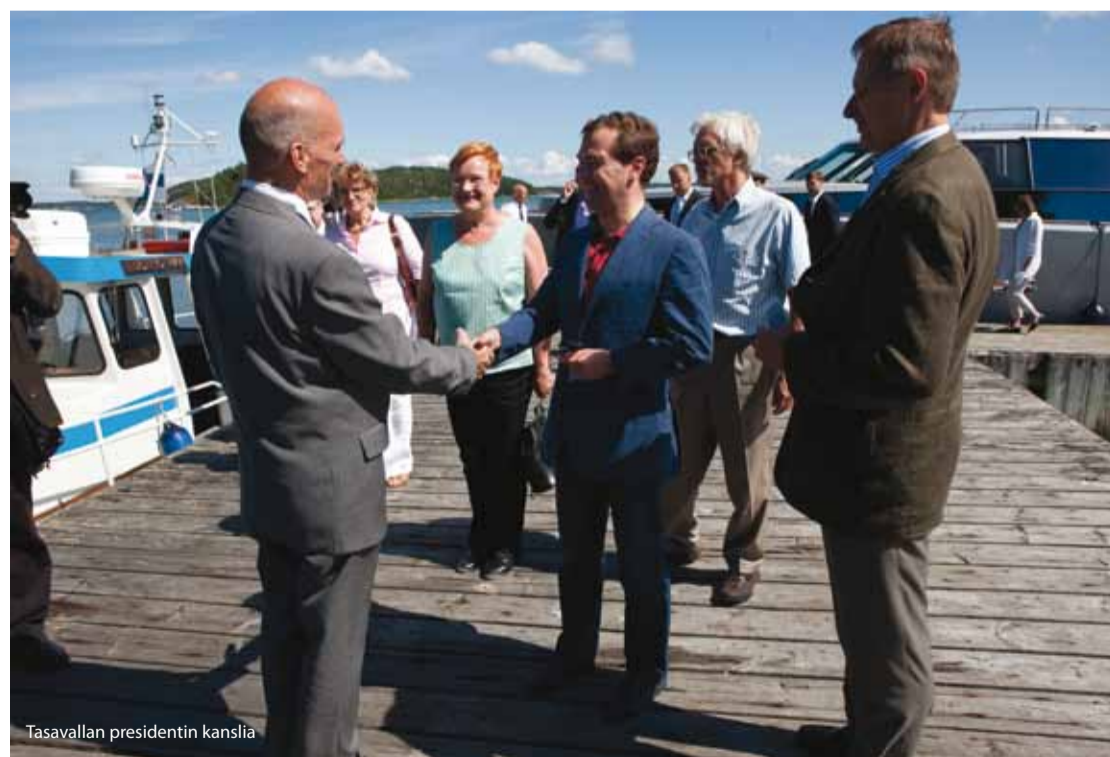
The AMBER project has been generating general interests already at the highest level of the stakeholders when it was presented to the presidents of Finland and Russia during their stay on the Archipelago Research Institute of the University of Turku in July 2010.