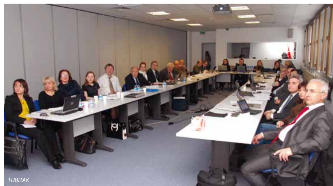
Participants at the first strategic workshop in Ankara on 11 March 2011

For more information, visit www.seas-era.eu/np4/3/54.html www.tubitak.gov.tr/